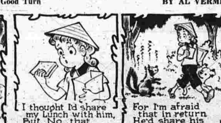
One Good Turn