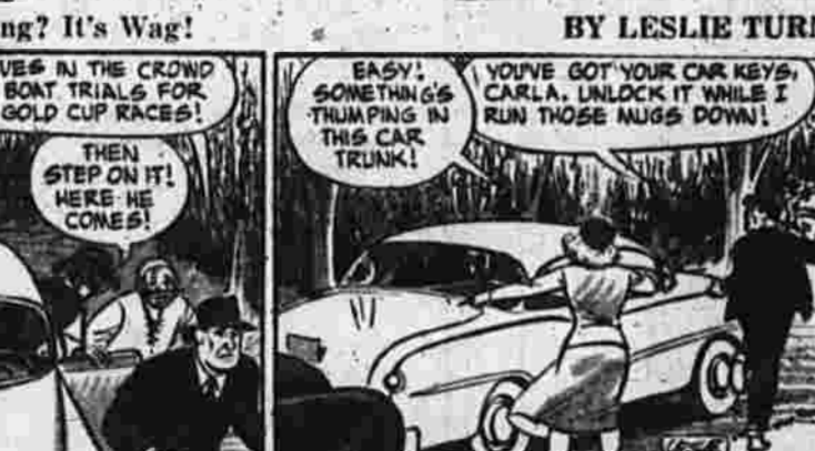
Thumping! It's Wag!