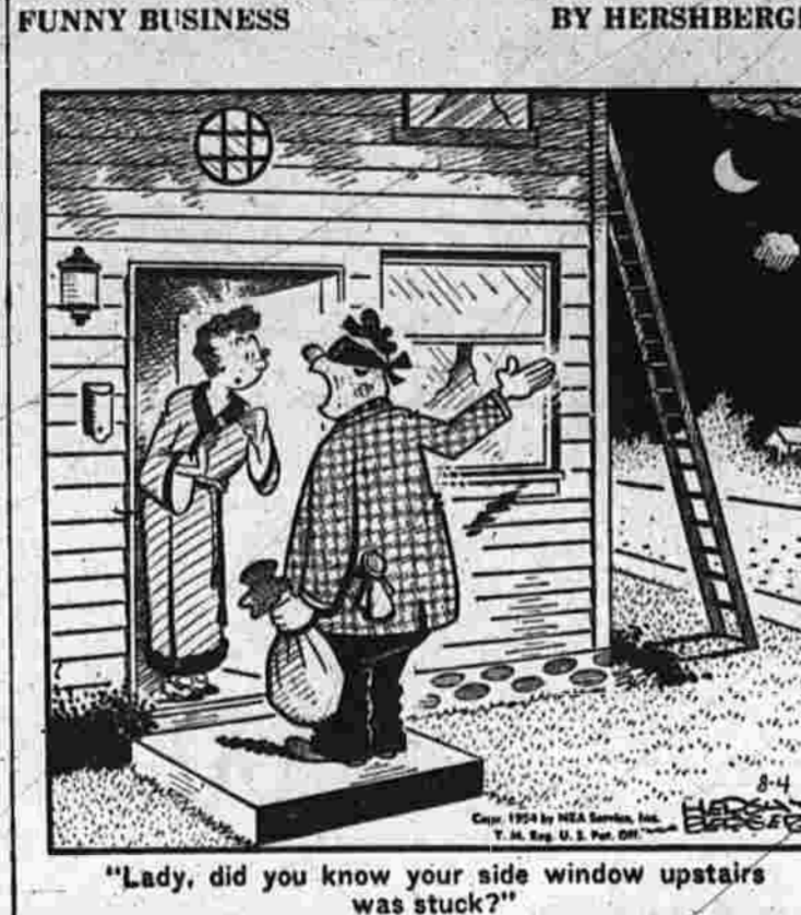
"Lady, did you know your side window upstairs was stuck?"