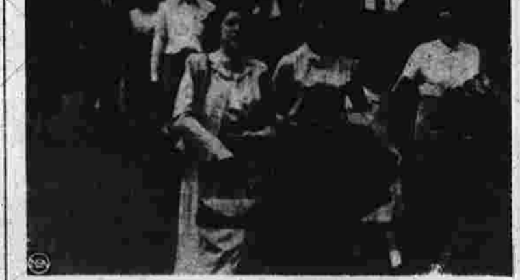
Sight-seers at the White House: It's a mass production operation, with the main emphasis on speed.