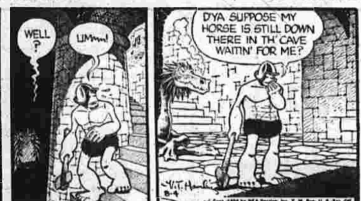
Did Ya Tell 'Em?'